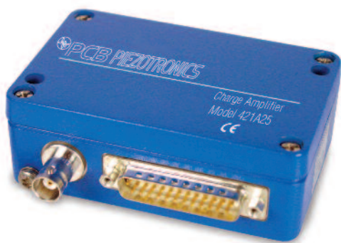
Series 421A25 Industrial Charge Amplifier

The Model 421A25 industrial charge amplifier is designed for piezoelectric charge output force or strain sensors and is ideally suited for monitoring manufacturing forces experienced during assembly, crimping, stamping or product testing. With its long discharge time constant and high frequency response, both quasi-static and dynamic measurements up to 20 kHz are possible.