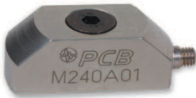
Series M240 Industrial ICP® Strain Sensors (Actual Size)

The Series M240 Industrial ICP® Strain Sensors incorporate piezoelectric quartz sensing crystals that respond to a longitudinal change in distance. The resultant strain measurand is an indirect measurement of stress forces acting along the structure to which the sensor is mounted. As such, these devices can provide insight into the behavior of mechanical systems or processes that generate an associated machinery reaction.